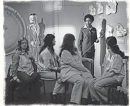
National WIC program began in 1974