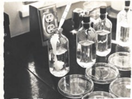
Water testing, date unknown