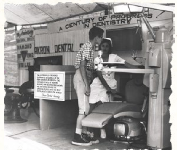
Akron Dental Society display, c.1962