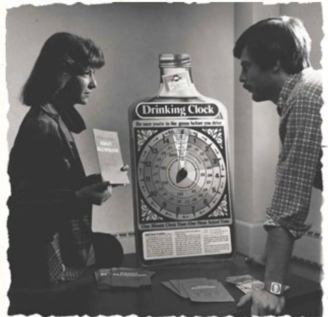
Alcohol awareness education, c.1980s