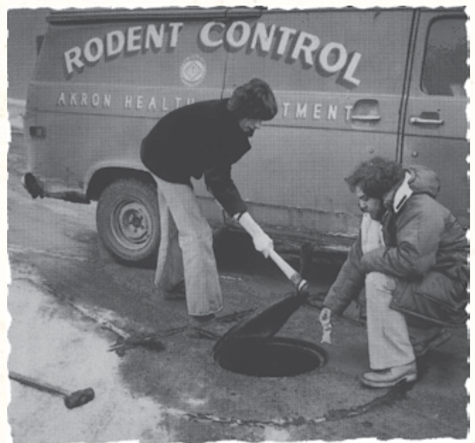
Akron Health Department Rodent Control, c.1970s