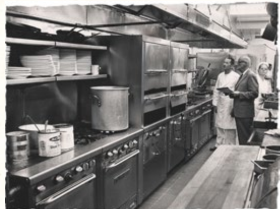
Restaurant inspection, c.1950s