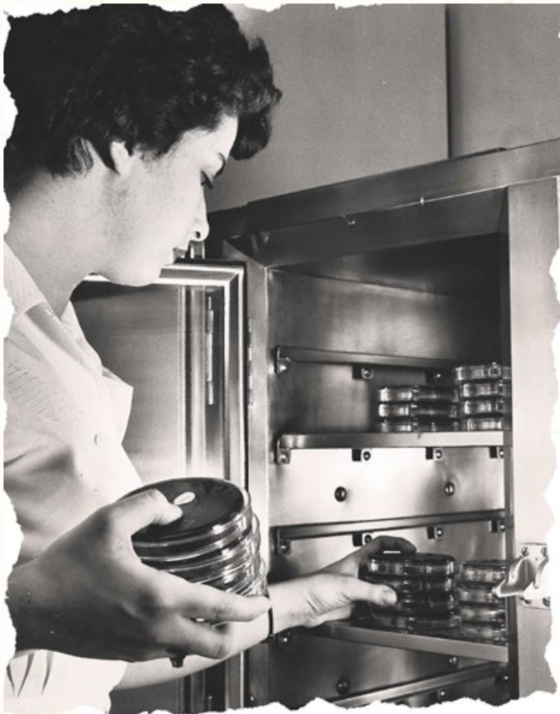
Culturing microorganisms, c.1960s

Total outbreaks investigated in 2019: 10